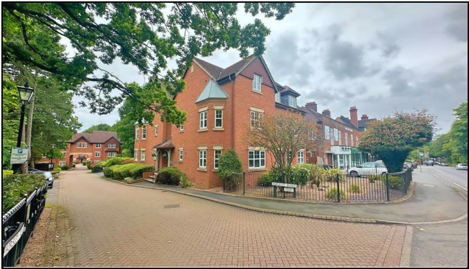
Horsley Road, Streetly, Walsall, B74 3FE